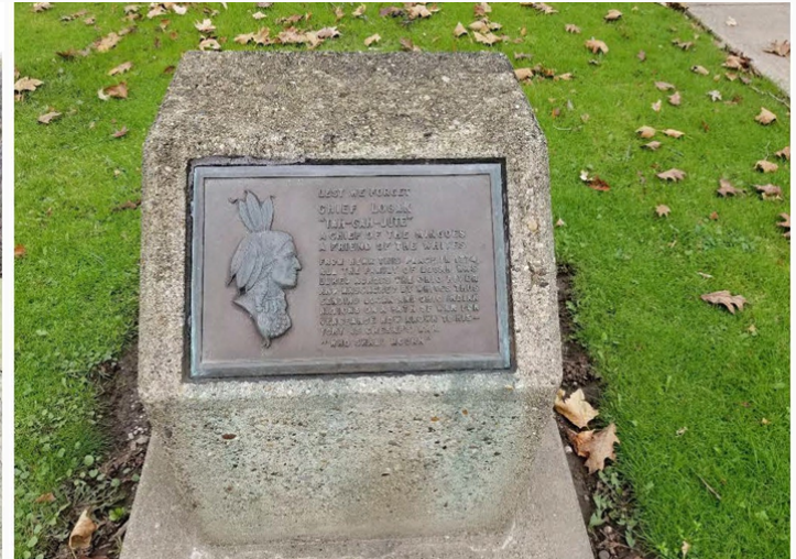
Tea Creek near Logan's cabin site, Mifflin County, Pennsylvania Logan "Tah-Gah-Jute" historical marker, Yellow Creek, Ohio