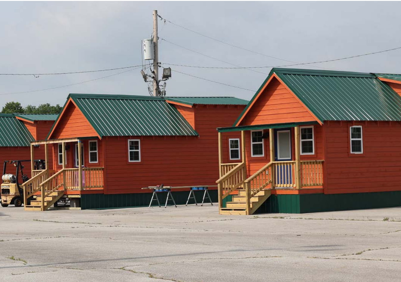
HAVEN Tiny Houses.