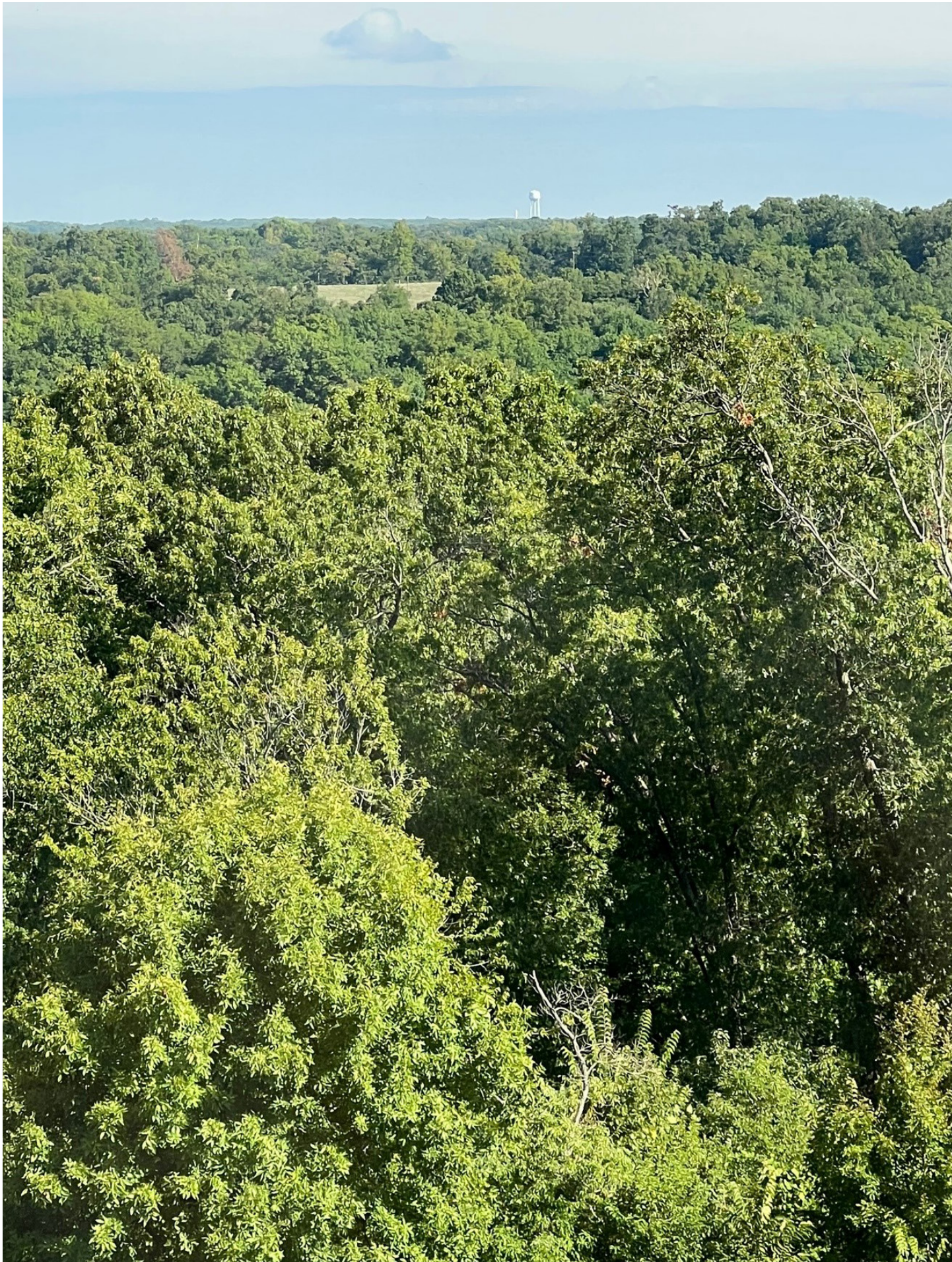
View of Tribal Water Tower from ISKY Tower Two.