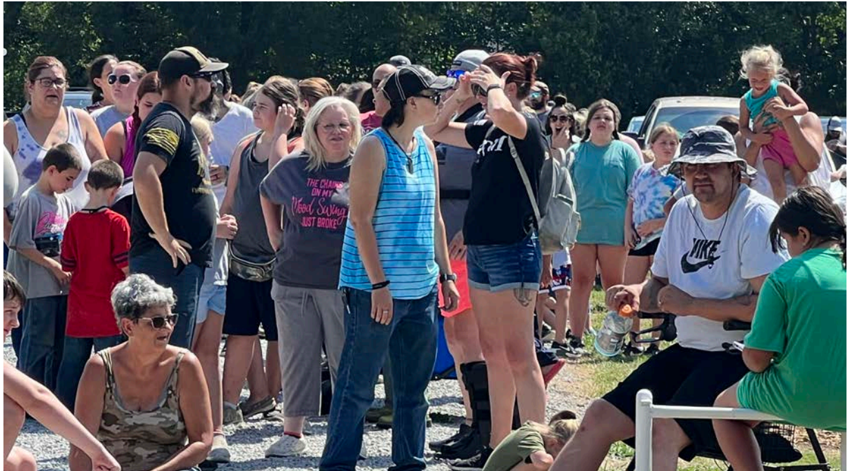
Children's Back-to-School Pow Wow