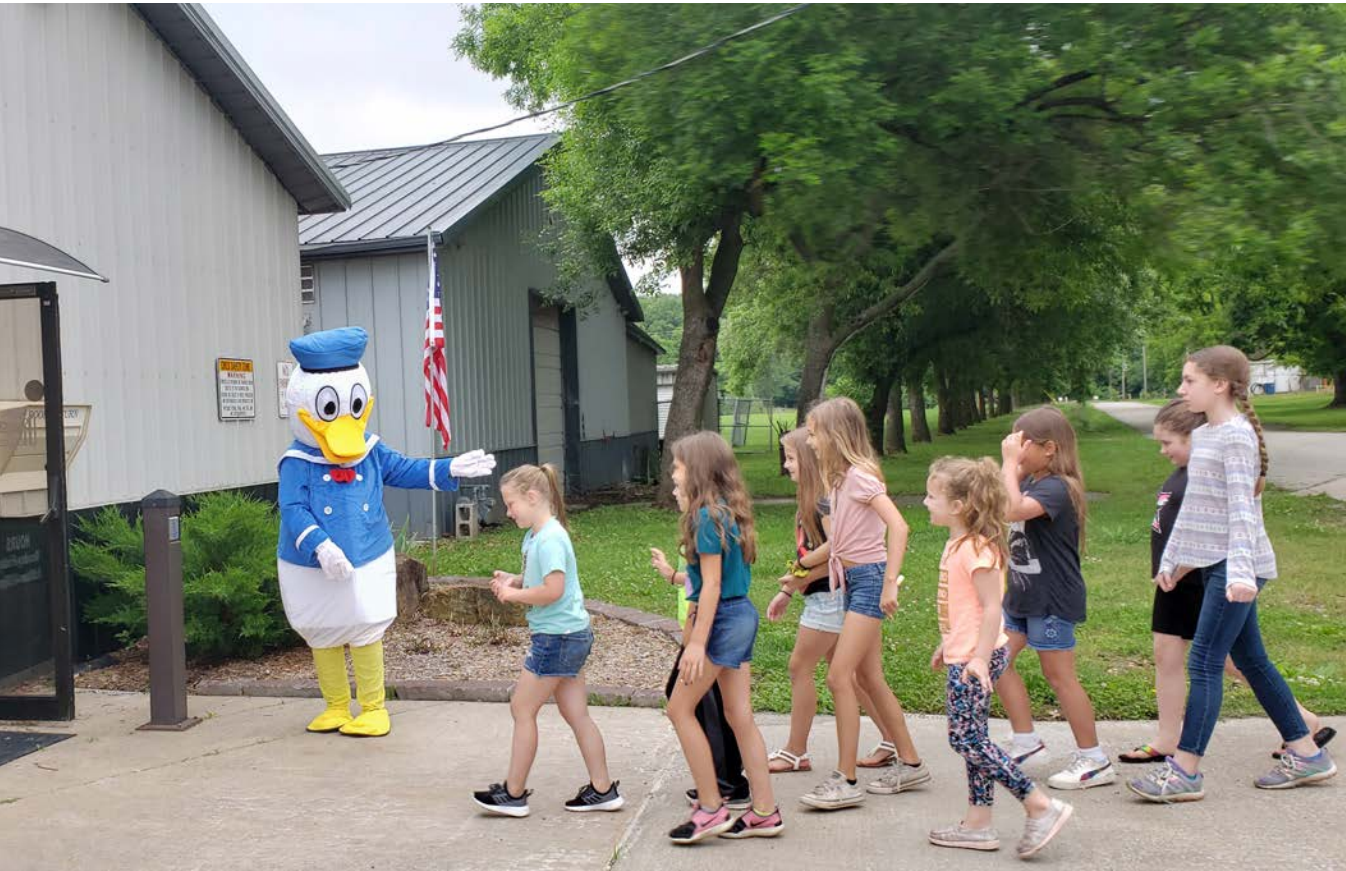
Library Summer Program.