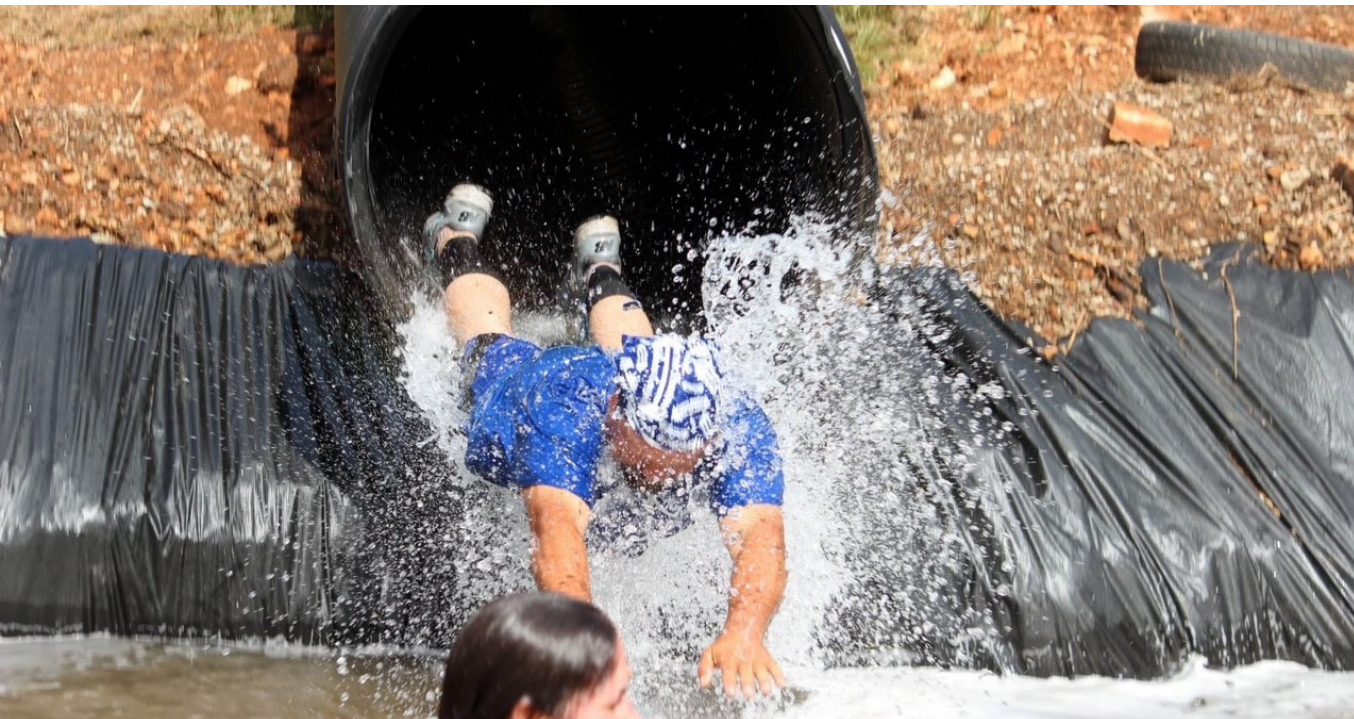
Tecumseh Warrior Challenge.