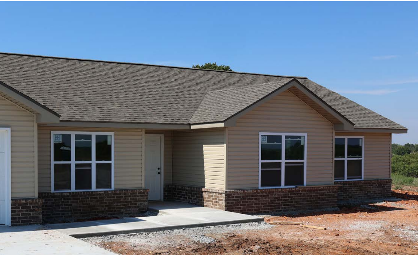
Housing Authority Construction.