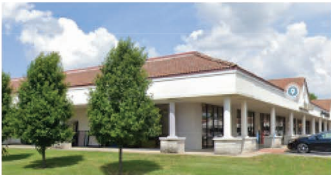
Joplin, 32nd Street Mortgage Office

We have an outstanding experienced staff that considers their employment a career choice and not just a job. Our name and brand recognition have become significantly relevant in the local market as we continue to grow market share. What we are building has become special.