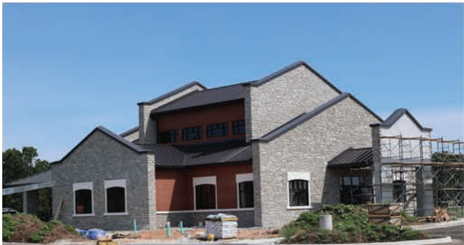
Neosho Branch (Under Construction)