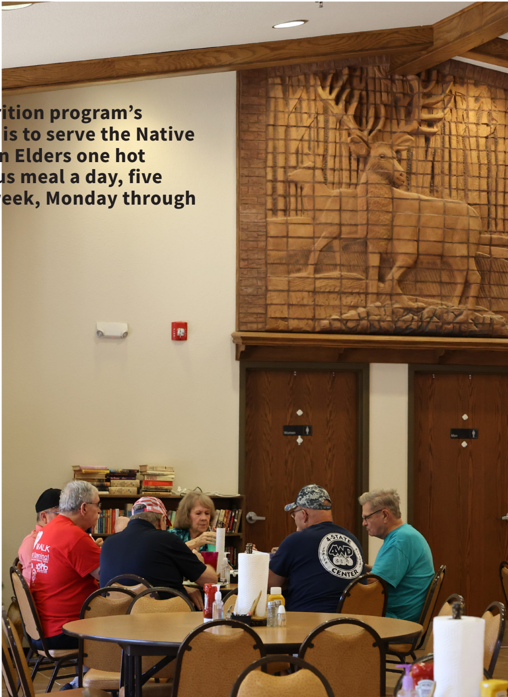
Lunch Time at the AOA.

The nutrition program's purpose is to serve the Native American Elders one hot nutritious meal a day, five days a week, Monday through Friday.