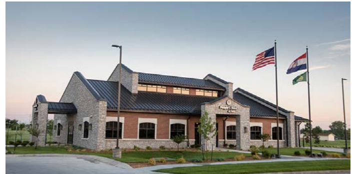
Joplin, 20th Street Branch