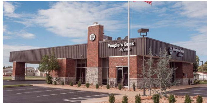
Joplin, Maiden Lane Branch