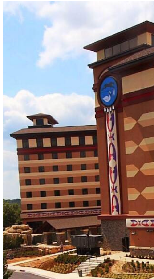
Indigo Sky Casino & Outpost Casino