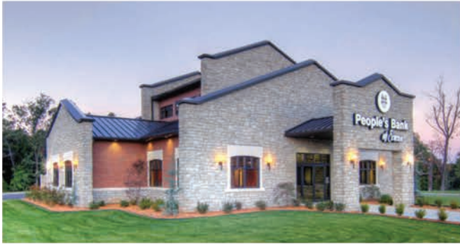
Loma Linda Branch