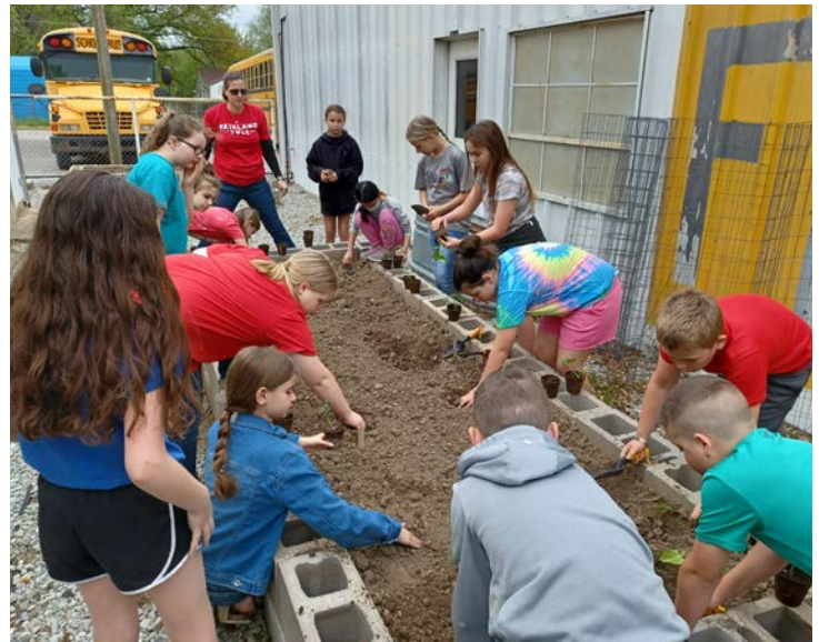
Plants being grown in Fairland schools, and students planting plants with Native Connections.

One of our department goals is to provide other alternatives to suicide and substance abuse for children and young adults. One of these ways is through gardening, whether this is providing a grow stand in a corner to be watered daily by the small children, teaching elementary students how to place seeds in pots and labeling them, to showing teenagers how to pick weeds from a prepared raised bed and plant seeds to grow. All these things are part of a process that we can use to educate youth on some of our traditional medicine and food, provide an opportunity for mentoring relationships, teach new skills, or simply provide a calming space for one seeking peace and quiet. Gardening has been shown to help those with dementia, anxiety, attention deficit disorders, stress disorders, PTSD, and addiction.